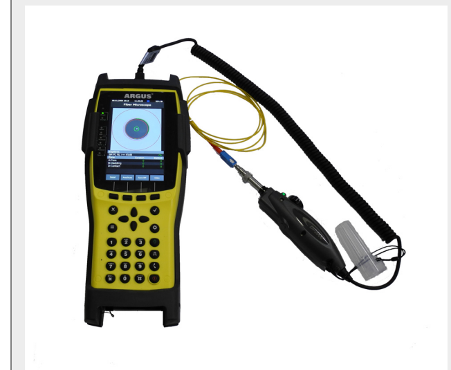
Figure 3: ARGUS 260 fiber multitester/multimeter for GPON-TE and PON installation tests, here with video microsope for optical inspection of glass fibers.

The generous touch display permits in-depth tests such as the optical fault finder and fiber inspection tool. The ARGUS 260 is additionally equipped with an optical light source that transmits a defined ID on a selected wavelength, and can be expanded using the optical power meter (OPM) to form an extremely precise ( \pm 0,25 dBm) optical loss test kit without having to cart around a full bag of gear.